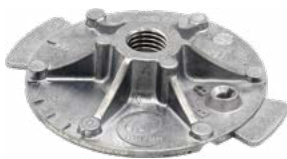
A-PED TP-1 Turning Plate