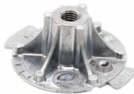
A-PED TP-2 Turning Plate